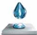
PIGMENT INK (traditional technologies)